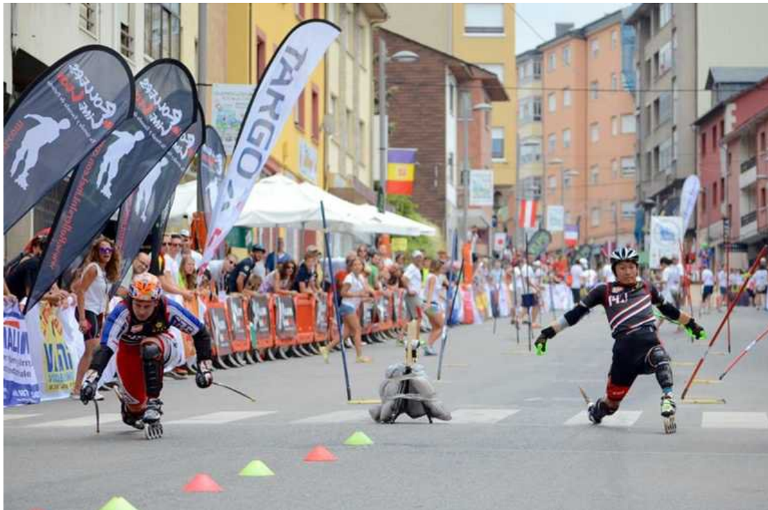
Parallel Slalom 2016

In 2015, this town organized, with great success, one race of the Inline Alpine World Cup; in 2016, the Giant & Team Race World Championships and, also, the World Cup Final and Parallel Slalom; and, in 2017, it will host European Championships and, also, one race of the World Cup.