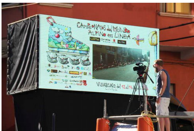
Big Screen and Camera